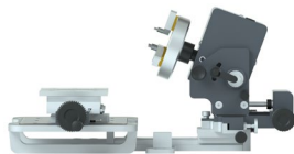
Cylindrical attachment & Rotary Devices

These accessories also deserve your full attention and can be covered by our after sales service. We cover the mechanical and electronic assemblies and repair or replace failed parts.