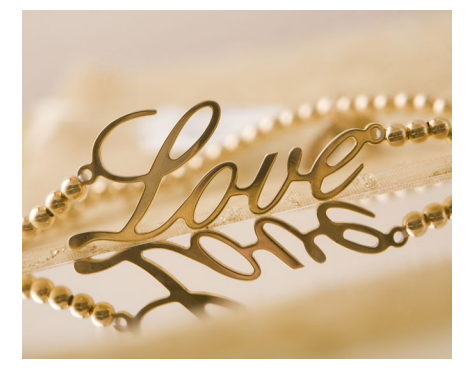
Cutting & engraving