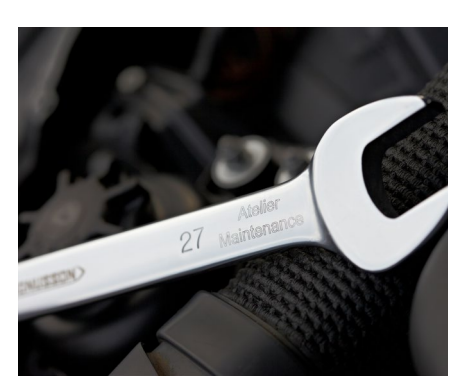
Marking tools for identification and equipment traceability