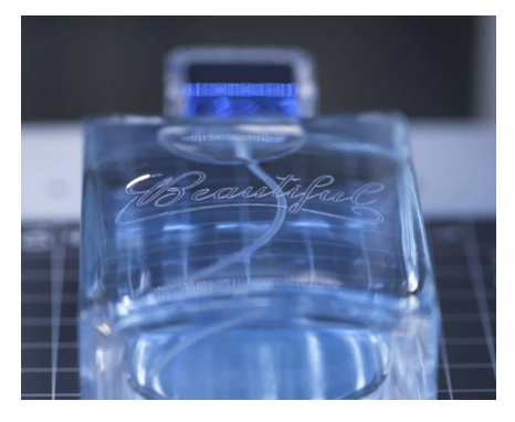
Cosmetics & luxury