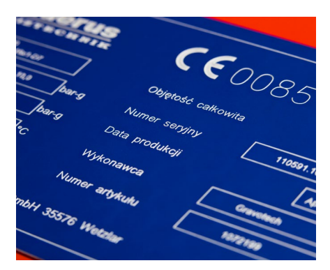
Traceablity of industrial parts