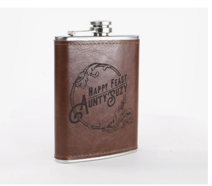
Gifts & personalisation