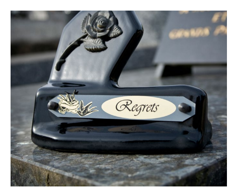
Funeral plaques and headstones engraving