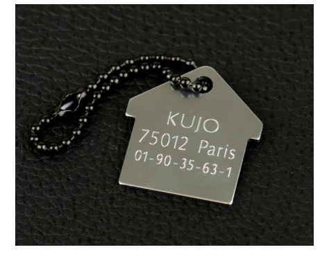
Pet and dog tags engraving