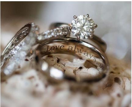
Personalising and engraving jewellery