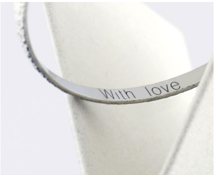
Personalising and engraving jewellery