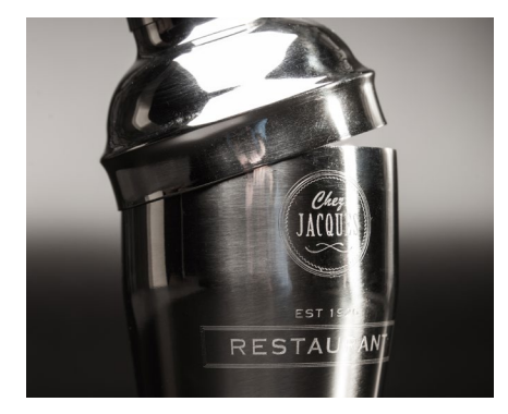
Gifts & personalisation