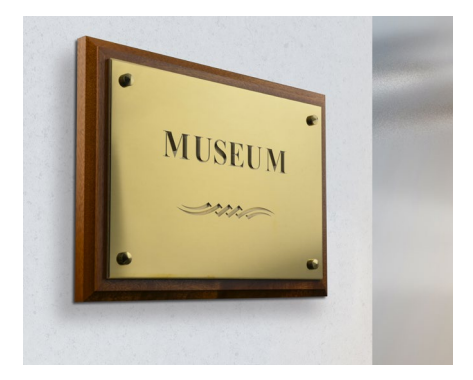
Professional and institutional plates