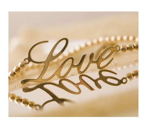
Fine metal cutting