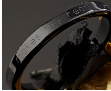
Personalising and engraving jewellery