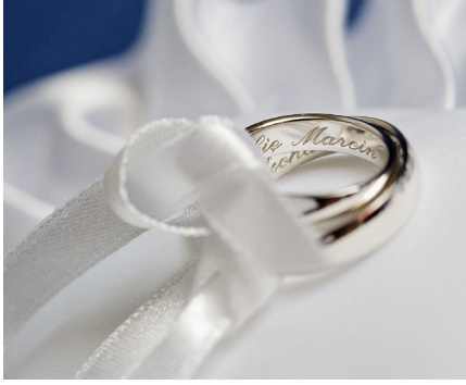
Personalising and engraving jewellery