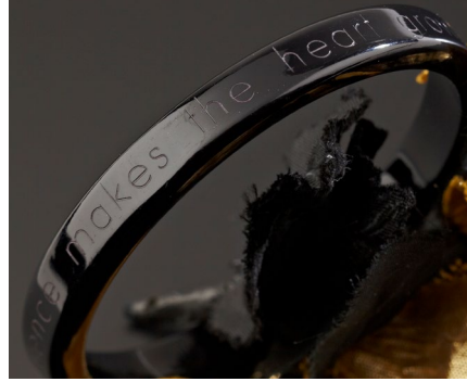
Personalising and engraving jewellery