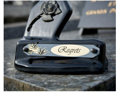
Funeral plaques and headstones engraving